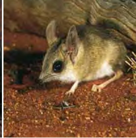
Photographs above left to right: Mungo National Park ; Kinchega National Park ; Mutawintji National Park ; Kultarr, a marsupial

evidence of one of the earliest uses of the grindstone in human history. The 65-km self-drive tour through the park, easily accessed via Wentworth, has 15 stops and takes in all the main attractions of the park.